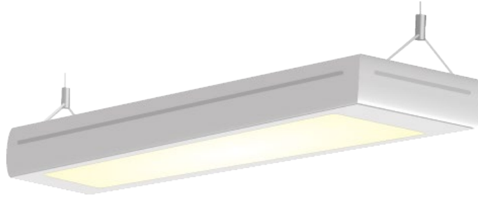
Figure 4: Isometric view of a linear ambient product with a luminous panel at the bottom. The luminous shape would be represented by a rectangle the size of the luminous panel only. If the sides were luminous, a rectangle with luminous sides would be used.