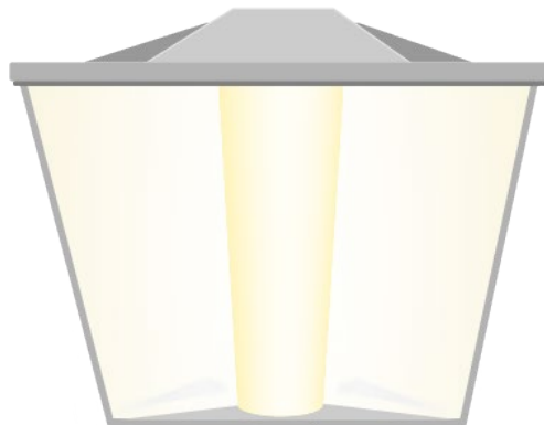
Figure 3: Isometric view of a troffer with a luminous basket and luminous panels on each side. The luminous shape would be represented by a rectangle or rectangle with luminous sides encompassing entire luminaire.